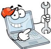
illustrations of.com #98833

Call (902)935-2053 or Email: drkcomputers@eastlink.ca for more info.